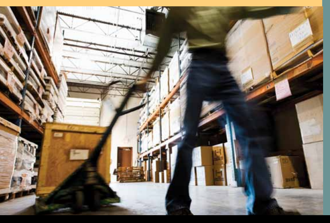
For fast reliable pick-up and delivery on your schedule, call today: